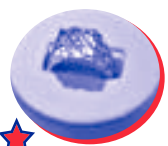
Men's Diamond Ring valued up to $1,000

Any member who opens any type of new account (share draft, loan, savings, debit card, etc.) or becomes a new member, will have their name entered into this special drawing to be held on January 5, 2011.